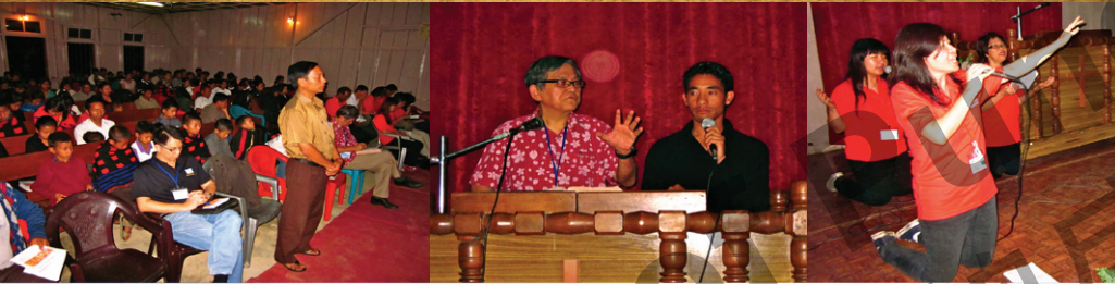
Day 5 15 th May Visit to Villages- Cultural Entertainment- Night Church Service