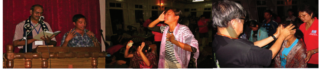
Day 6 16 th May Youth Camp- Night Church Service