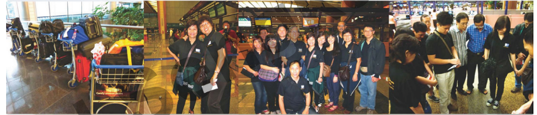
Day 2 12 th May Depart from Kolkata to Dimapur