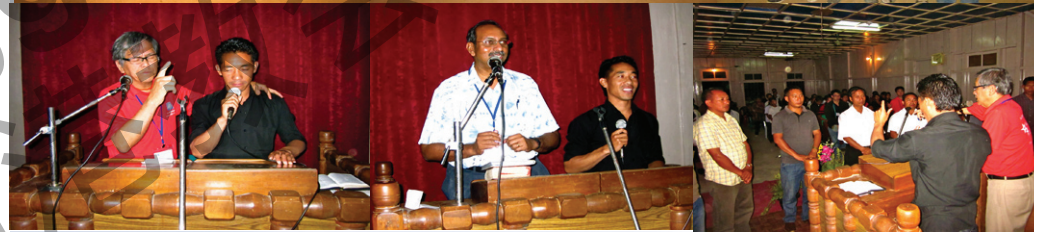
Day 7 17 th May Parenting & Marriage Workshop- Leadership Workshop- Night Church Service