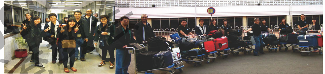
Day 3 13 th May Arrival @ Noklak, Nagaland